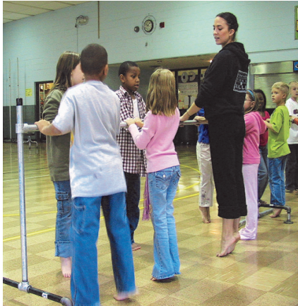
Relevé straight and tall! Carrie Busey Elementary School students learn ballet techniques during P.E.

Thanks to generous donors like you, Champaign Urbana Ballet was able to expand significantly our community outreach efforts in 2006.